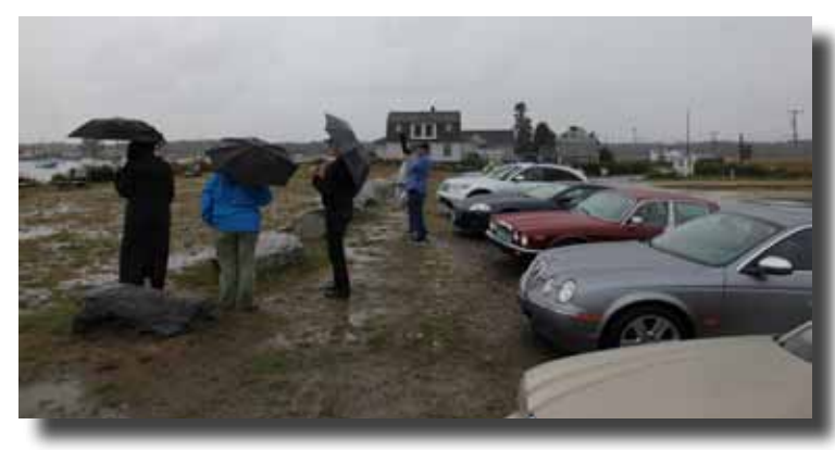
Die-hard JANE members brave the cold and raw to get a closer look at the ocean.

Our driving route started at our meeting point, the Portsmouth, New Hampshire traffic circle liquor store, a convenient location for all our needs and an easy-to-find parking lot for our Jags. This year's tour consisted of a 50-mile route of coastal and back roads. Early in the driving tour we caught up with the Tech Session folks from Brit Bits.