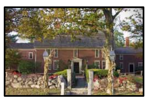
Longfellow's Wayside Inn 72 Wayside Inn Road Sudbury, MA 01776